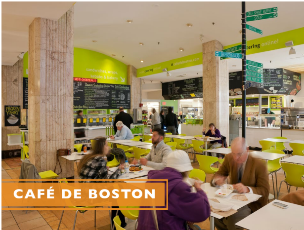
CAFÉ DE BOSTON